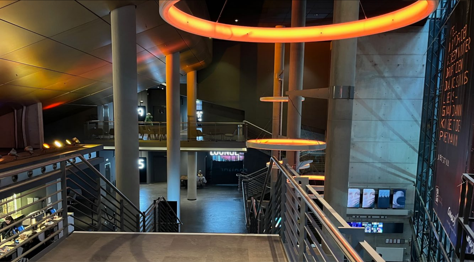
CinemaxX Berlin Fully refurbished reclined seating site opened February 2023