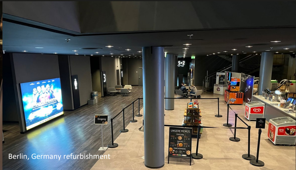
Berlin, Germany refurbishment