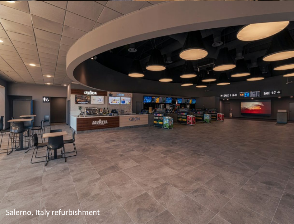
Salerno, Italy refurbishment