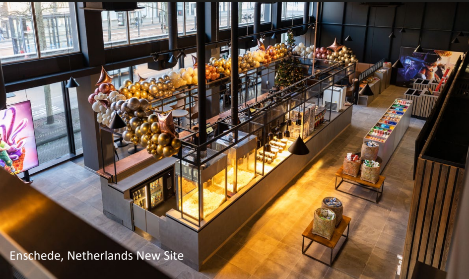
Enschede, Netherlands New Site